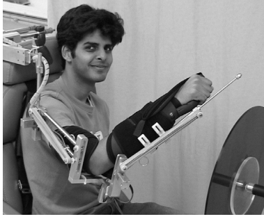
Figure 1. Training-WREX